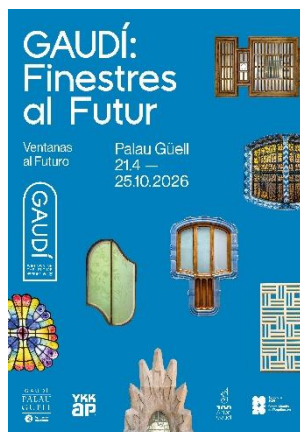
Main visual for the Barcelona exhibition

The main exhibition will be held at the Gaudí-designed UNESCO World Heritage Site Palau Güell(*3) from 21 April (Tue.) to 25 October (Sun.). Additional offerings themed on Gaudí’s windows, including pop-up exhibitions, documentary video screenings, and a book, will also be presented at several other Gaudí landmarks across Spain. The satellite exhibition, developed based on the same concept as the main exhibition, will be held from 16 May (Sat.) to 12 July (Sun.) at 21_21 DESIGN SIGHT Gallery 3 (Tokyo Midtown), located in the Roppongi area.